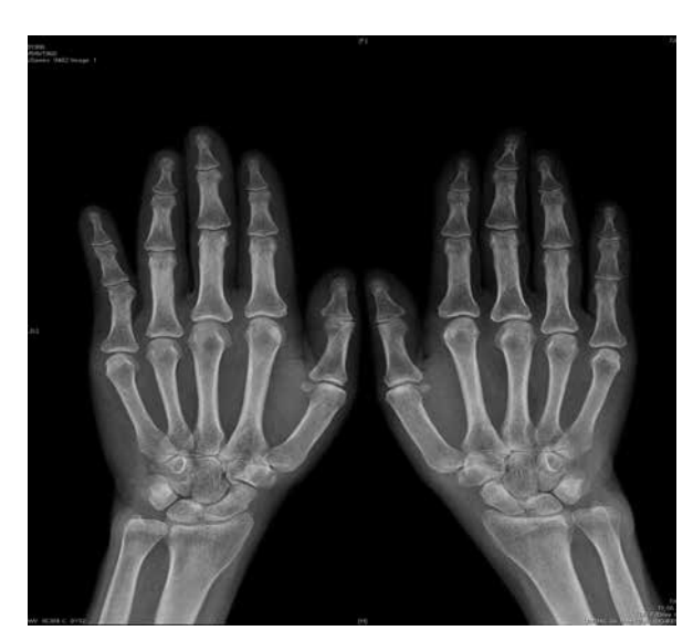
Fig. 2. Radiography of the hands. Erosion of the fourth metacarpophalangeal joint of the right hand was noted.

The methylprednisolone dosage was increased to 40 mg/day and disease-modified antirheumatic drugs with methotrexate added. One month later the articular symptoms resolved and the ESR and CRP values normalised. The corticosteroid dosage was tapered slowly by 4 mg/day every 10 days and methotrexate was continued.